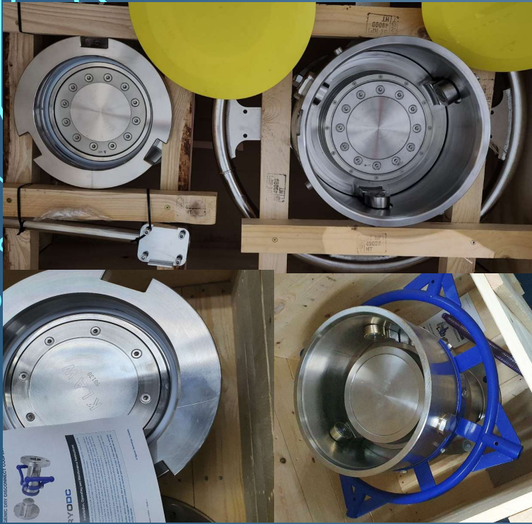
Dry Disconnect coupling-4pc