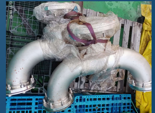
Y Piece 1 6inch:8inch -6pc